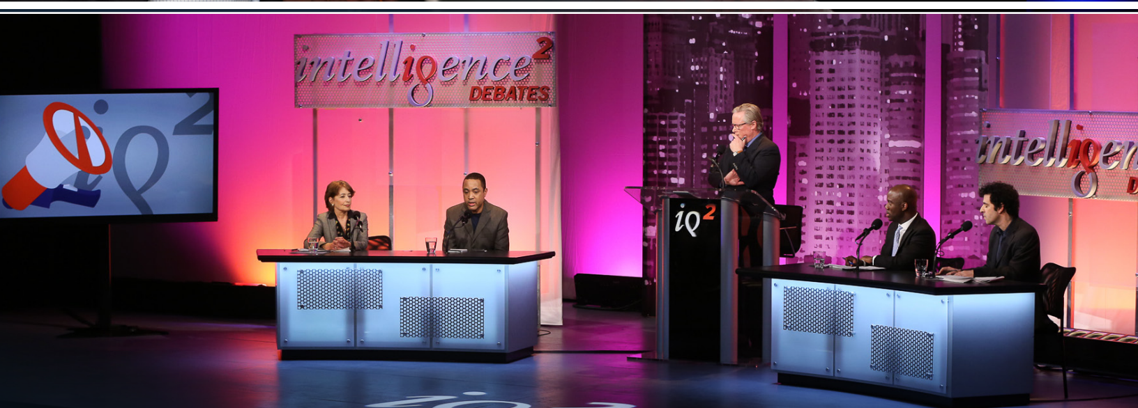
MI-Sponsored IQ2US "Freedom of Speech on Campus" Debate, March 2016