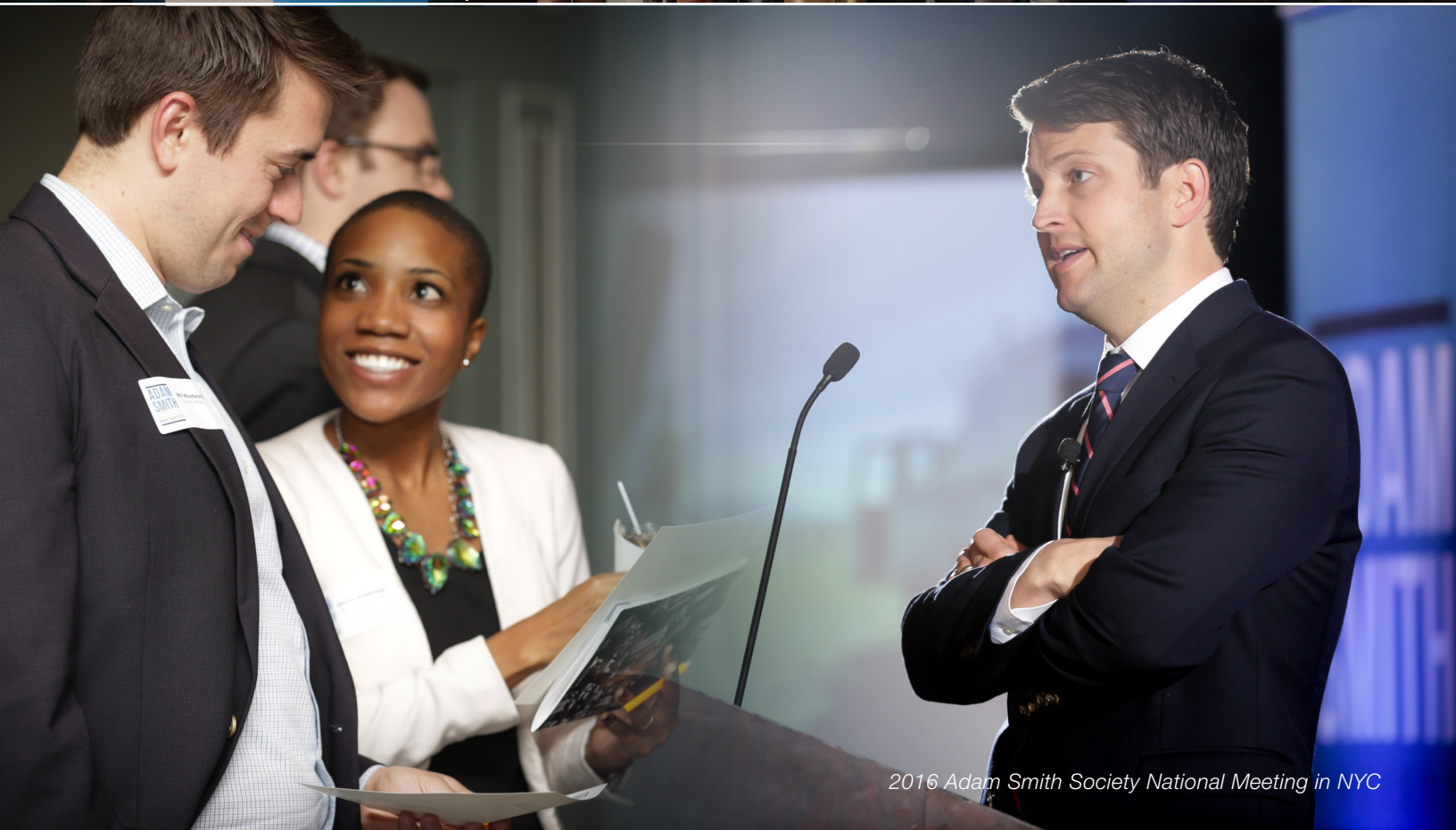
2016 Adam Smith Society National Meeting in NYC